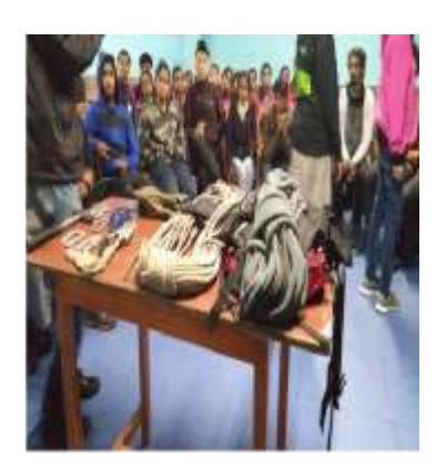
Figure 1: Registration and Lecture on Ropes and Instruments