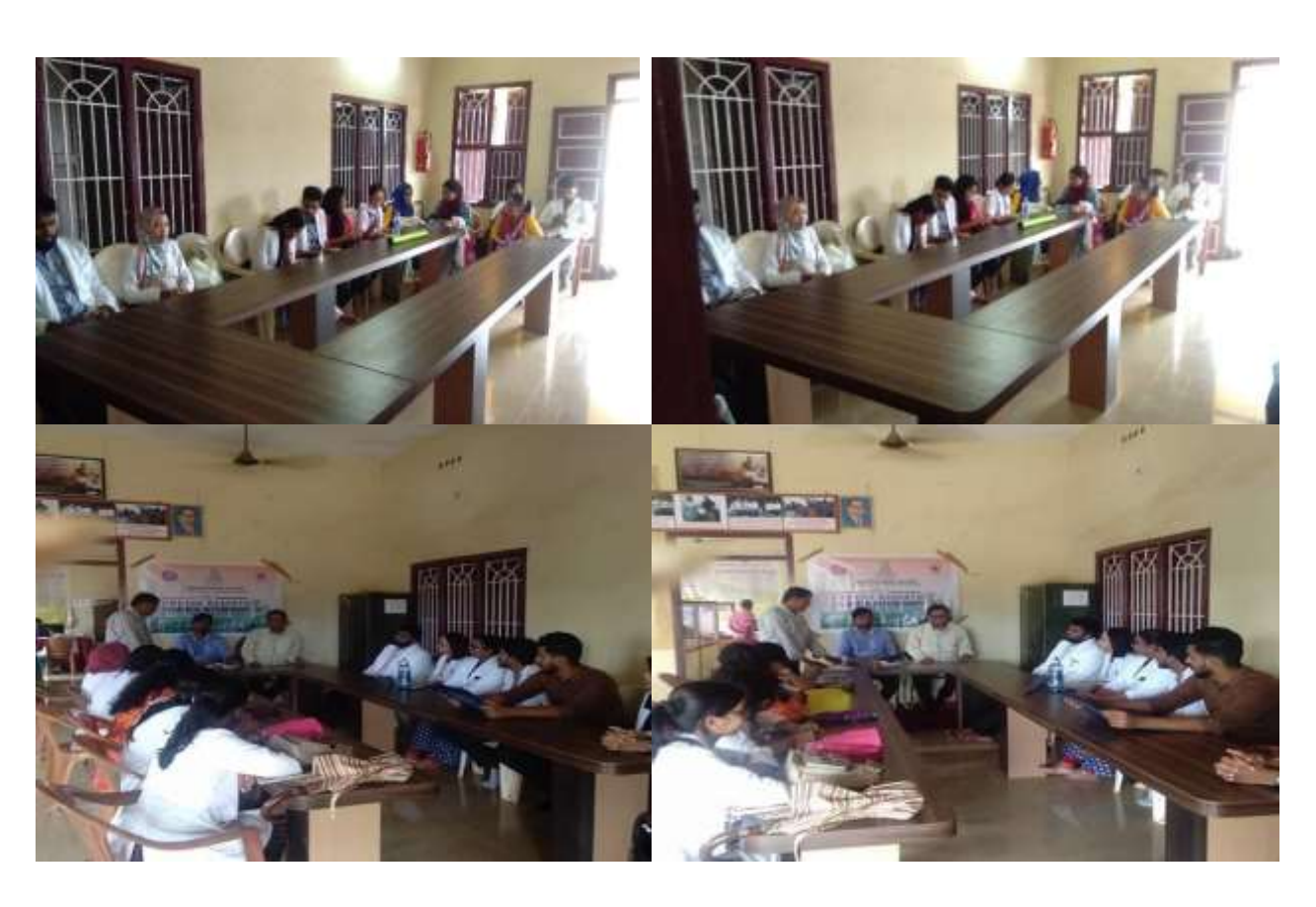
Figure 15: Planning for the Biogas plant

The bio gas plant at school area was discussed and cost and company was finalized and it was decided that the central government should fund such programs.