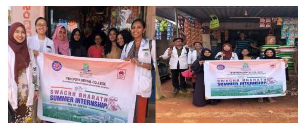
Figure 10: Commercial shops awareness plastic and its harmful effects

Number People Sensitized: 50 Number of Hours Spent: 10