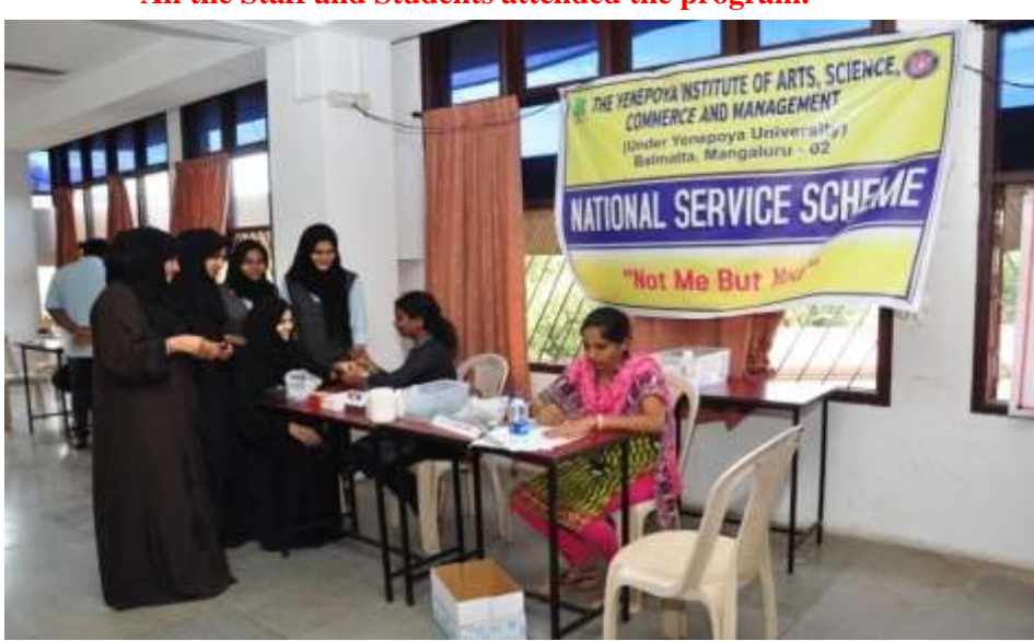
All the Staff and Students attended the program.

The NSS wing of the college in collaboration with Rural Health and Community Development Centre of Yenepoya University conducted a Blood grouping and General Health Check up in the College Auditorium on 13 Oct 2017 at 9 a.m.