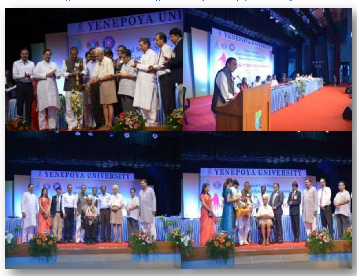
Inauguration of National Integration Camp at Yenepoya University

National Service Scheme Yenepoya University in association with National Youth Project Organized National Integration camp for youth at Yendurance Yenepoya University from May 1<sup>st</sup> to May 7<sup>th</sup> 2017 Participants: 500 students from 19 states