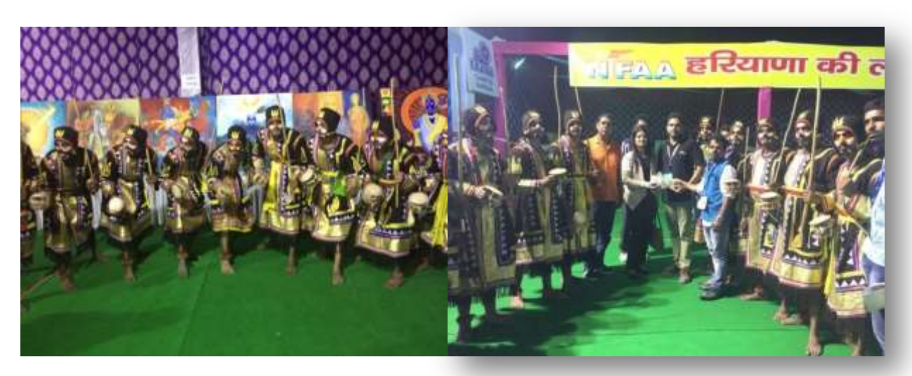
NSS Volunteers from the university representing Karnataka state for the International Youth Festival held at Karnal Hariyana