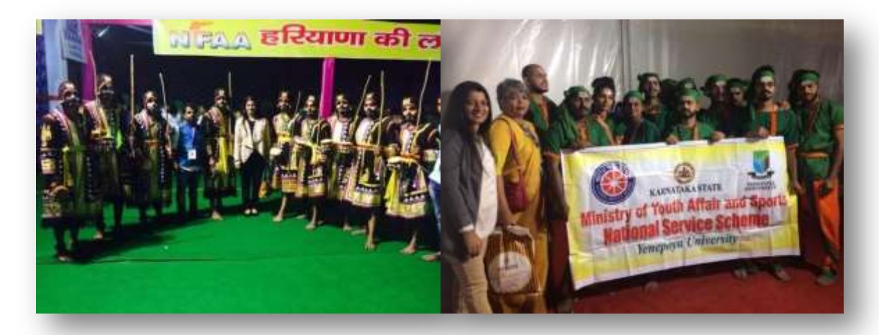
Figure. 1 Yenepoya University students with The Delegates from Russia, Japan, Newzeland