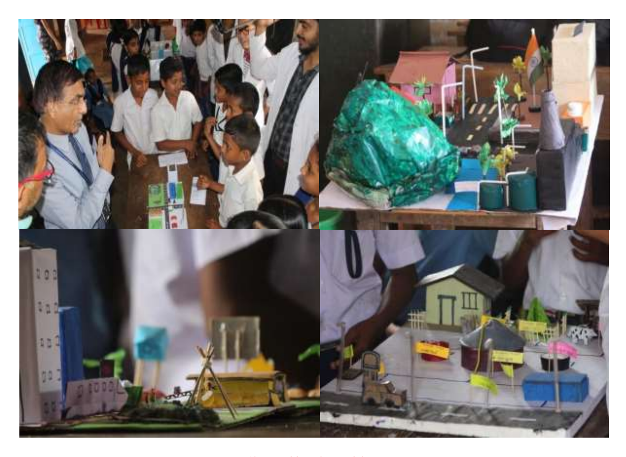
Figure 12: Swachh Mela, Model Competition

The students of the primary school of Sajipanadu and the volunteers of the Yenepoya Dental College had organized a Swachhata Mela with the model presentation done by the students with their mentors