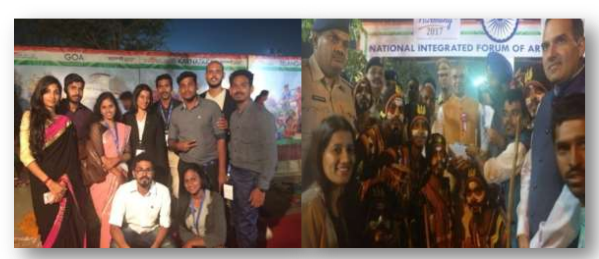
Figure 2. Yenepoya Students team-Cultural performance