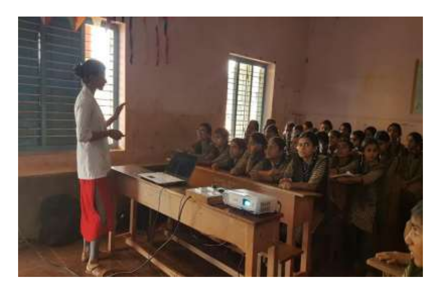
Figure 14: Personnel Hygiene Awareness