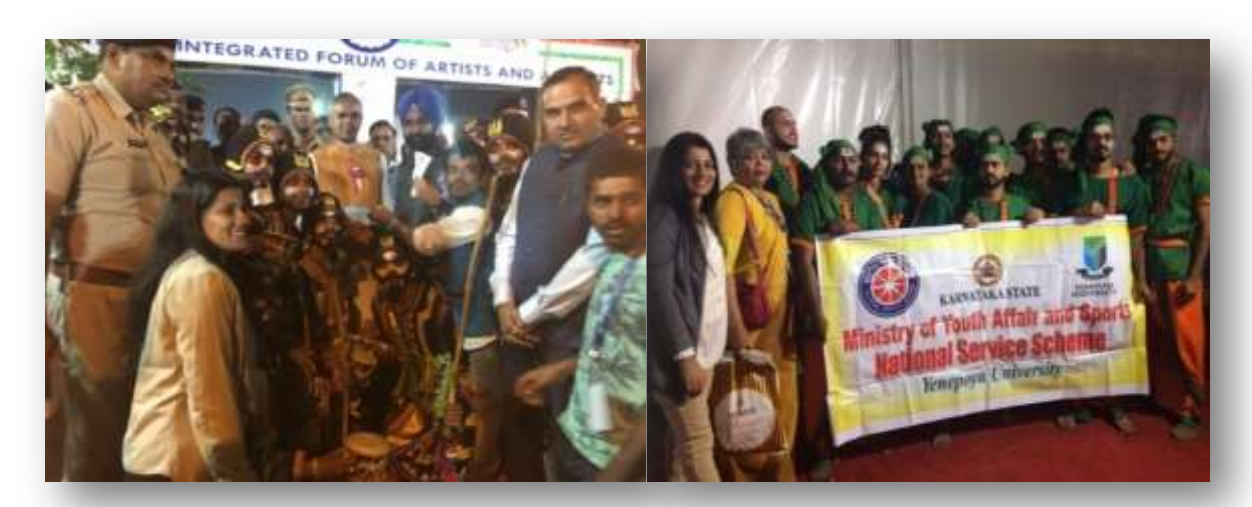
Figure 3. Students with governor of Himachal Pradesh