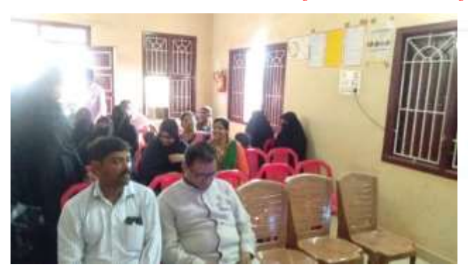
Figure 9: Awareness Programme and Movie Screenig

Number People Sensitized: 50 Number of Hours Spent: 05