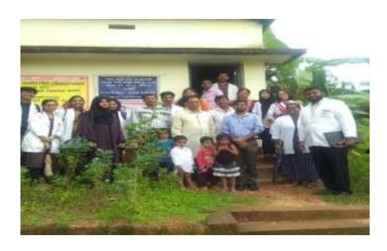
Figure 1: Anganwadi Health Education