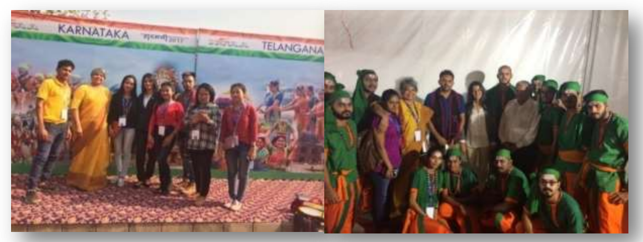
Figure 5. Unity in diversity, 4500 students from 29 states and 4 countries participated in harmony 2017