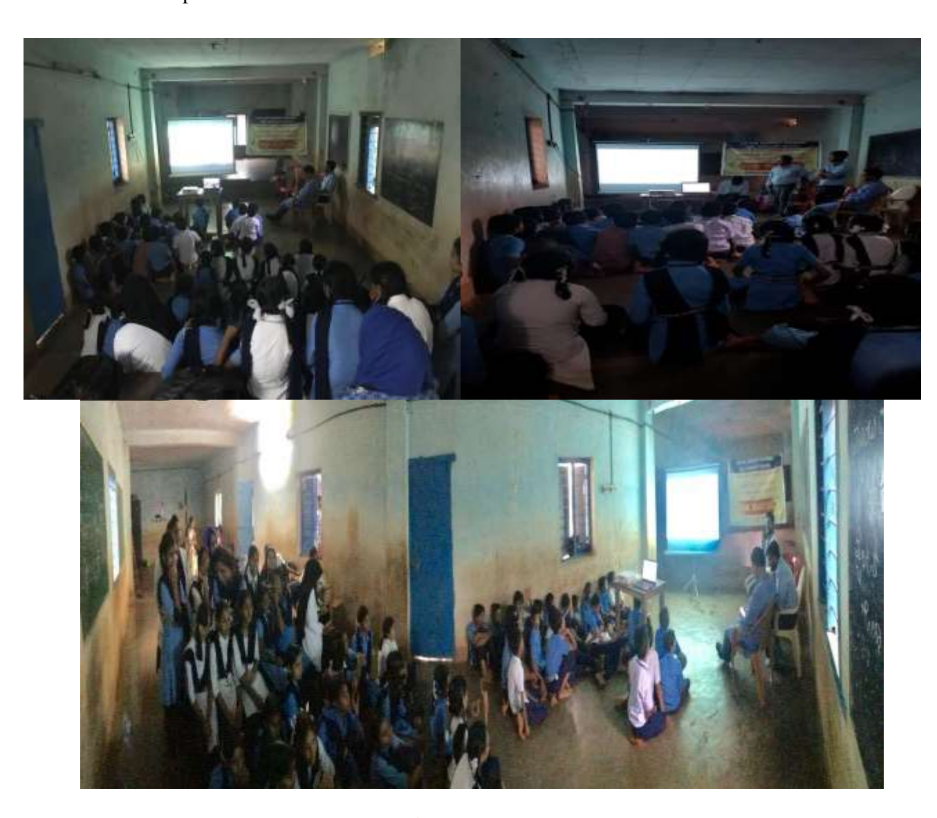
Figure 16: Movie Screening

Number of attendees: 330 Number of hours spent: 05